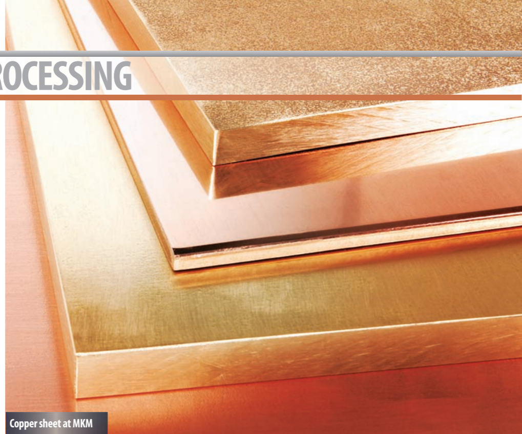
Copper sheet at MKM

CONTACT ARKU Maschinenbau GmbH www.arku.de